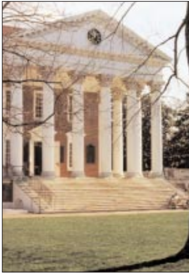
Rotunda, the University of Virginia